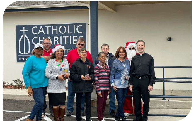
CCCTX staff, Knights of Columbus, and volunteers pass out food and baskets to local families in need for Christmas.